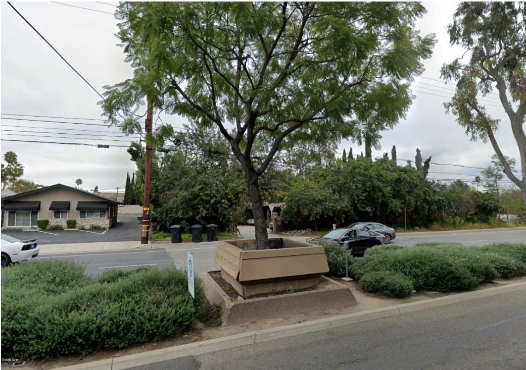
Existing Planter Type