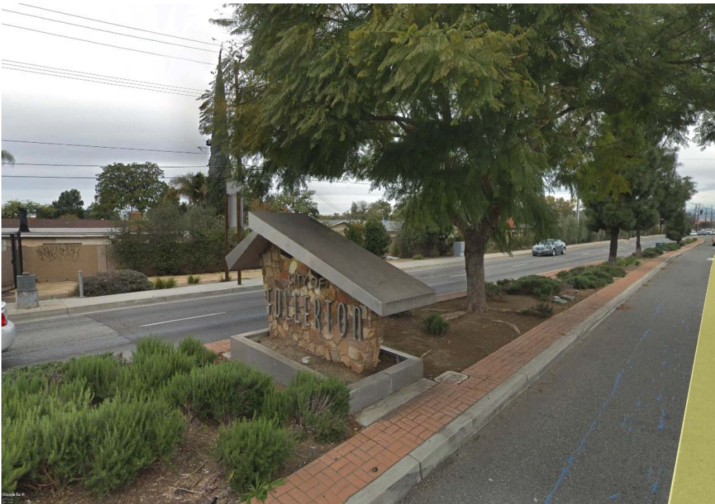
Existing House Type